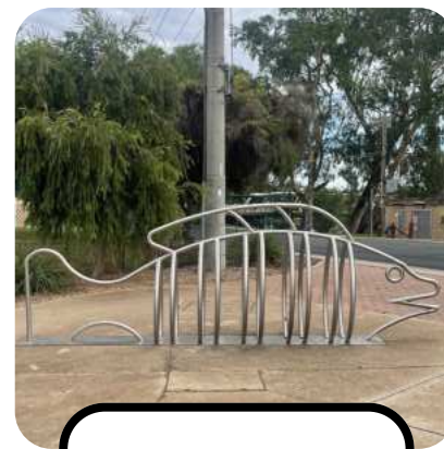
Bike Rack Swan Hill Outdoor Pool