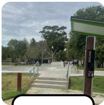
Swan Hill Skate Park Riverside Park