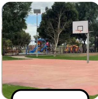
Basketball Court Barry Steggall Park