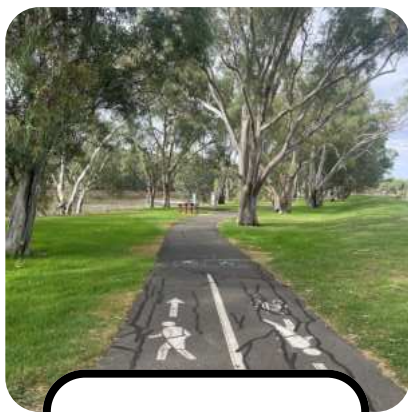
Milloo Street Boat Ramp Swan Hill River Walk