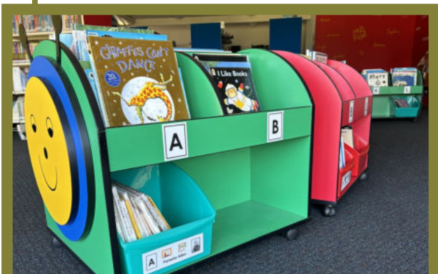
Picture Book Collection

When you are finished, please return books to the Swan Hill Christian School Office. Thank you.